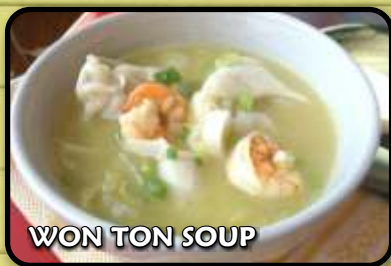
WON TON SOUP