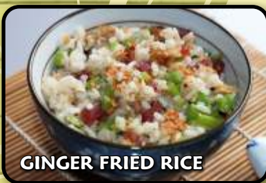
GINGER FRIED RICE